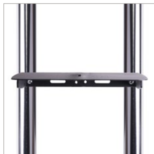
Shelf can also be mounted across 2 poles using 2 collars