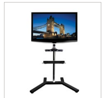
Mount additional shelves as required