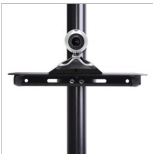
Shelf can be mounted onto a single pole using 1 collar