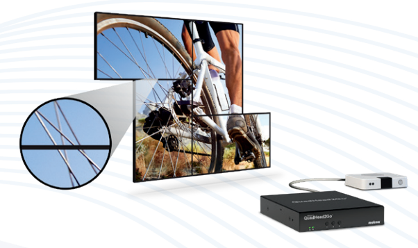
Fine-tune bezels for seamless image displays