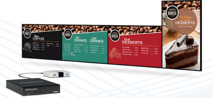
Rotate and position outputs independently from one another