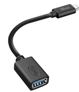
PRODUCT VISUAL 2