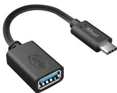
PRODUCT VISUAL 3