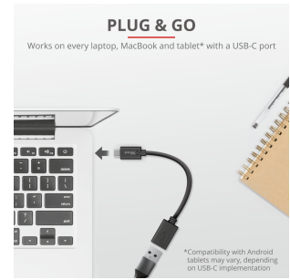
PRODUCT PICTORIAL 2