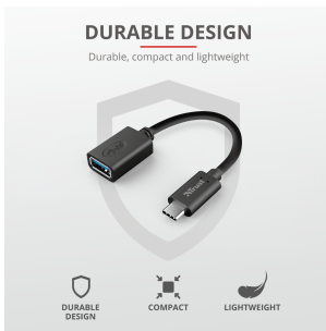
PRODUCT PICTORIAL 3