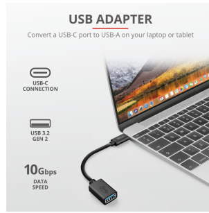
PRODUCT PICTORIAL 1