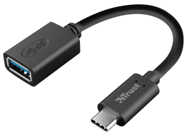
PRODUCT VISUAL 1